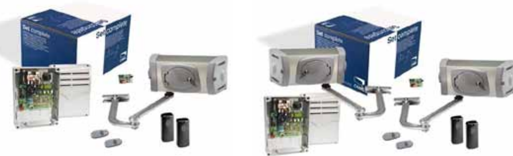
CAME Double Ferni 4m 230v High Intense Usage 4m 24v