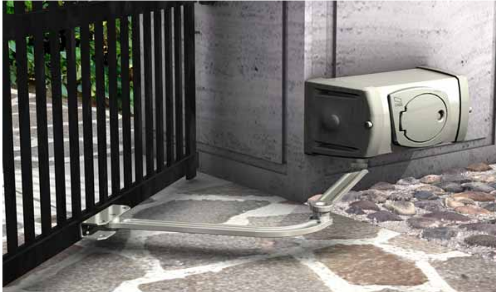
CAME Single Ferni 4m 230v High Intense Usage 4m 24v