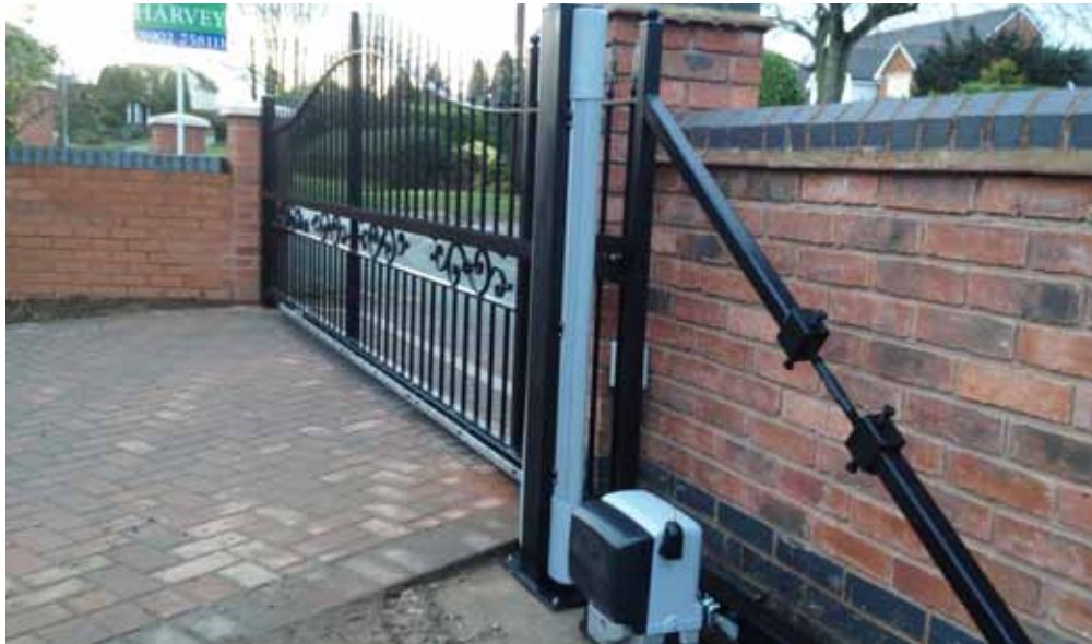
Came Single Sliding Automation Kit (up to 600kg) 24V