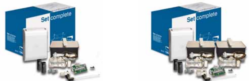
Came Double Underground 230V High Intense Usage 24V